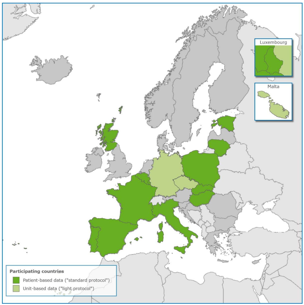
Figure 1. Participation in surveillance of healthcare-associated infections in intensive care units, EU/EEA, 2016