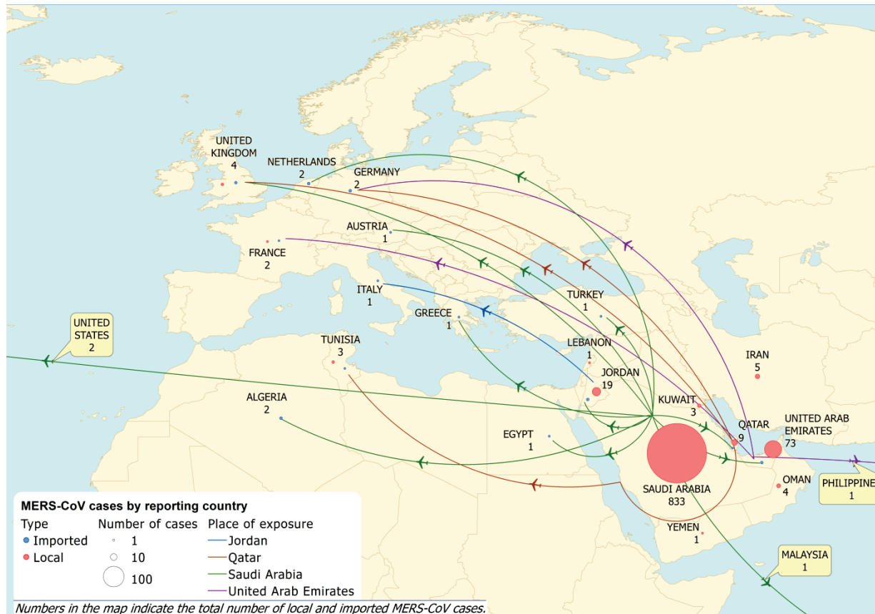
Figure 2. Geographical distribution of confirmed MERS-CoV cases and place of probable infection, worldwide, as of 13 January 2015 (n=972)

All cases reported from outside the Middle East have had a recent travel history to the Middle East or contact with a case that had travelled from the Middle East (Figure 2)