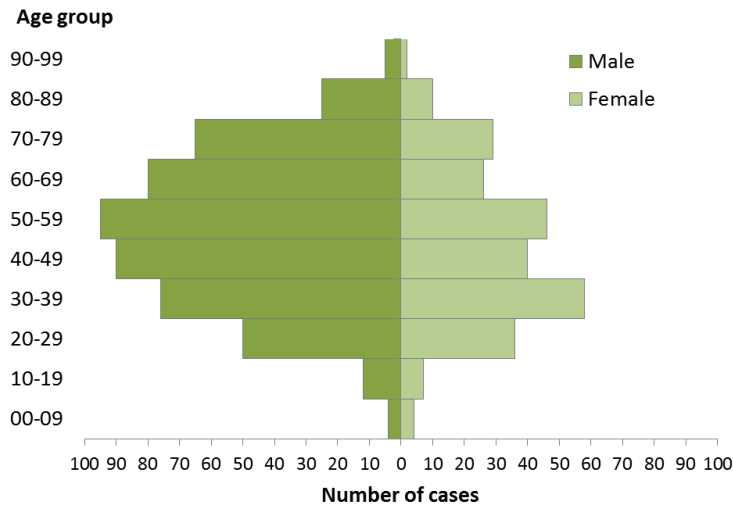
Figure 3. Age and gender distribution among confirmed cases of MERS-CoV (n=760)

Of the 760 cases where age and sex is known, 47% (n=360) have been males above the age of 40 years (Figure 3).