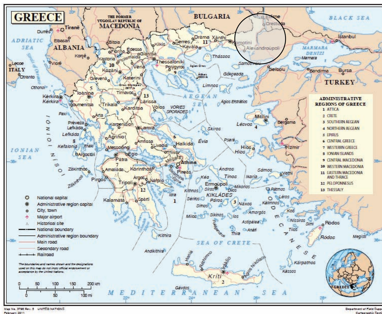
Figure 1: Map of Greece and Evros prefecture