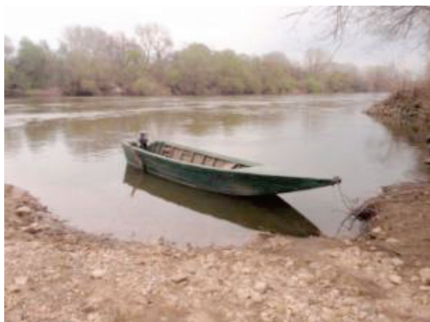
Figure 2: River Evros, April 2011