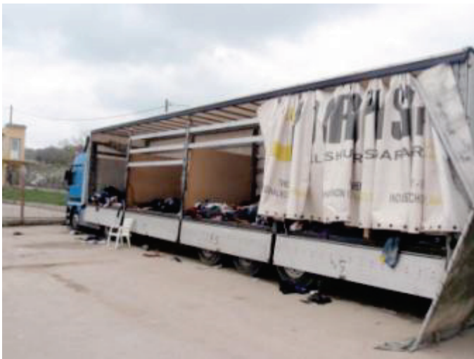
Figure 10: Confiscated truck at Fylakio, April 2011