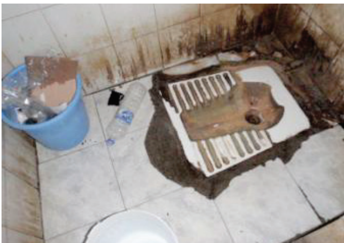
Figure 13: Toilet facility in one of the detention centres, April 2011