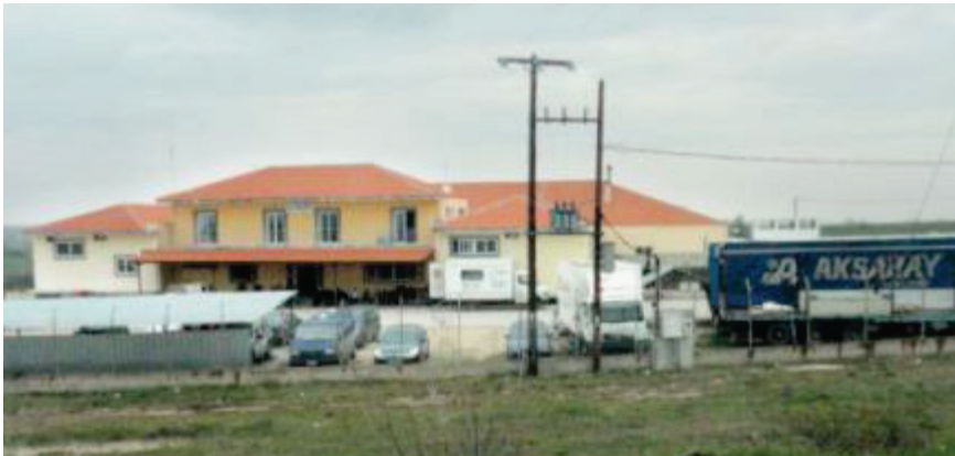
Figure 11: Detention centre Fylakio from outside, April 2011