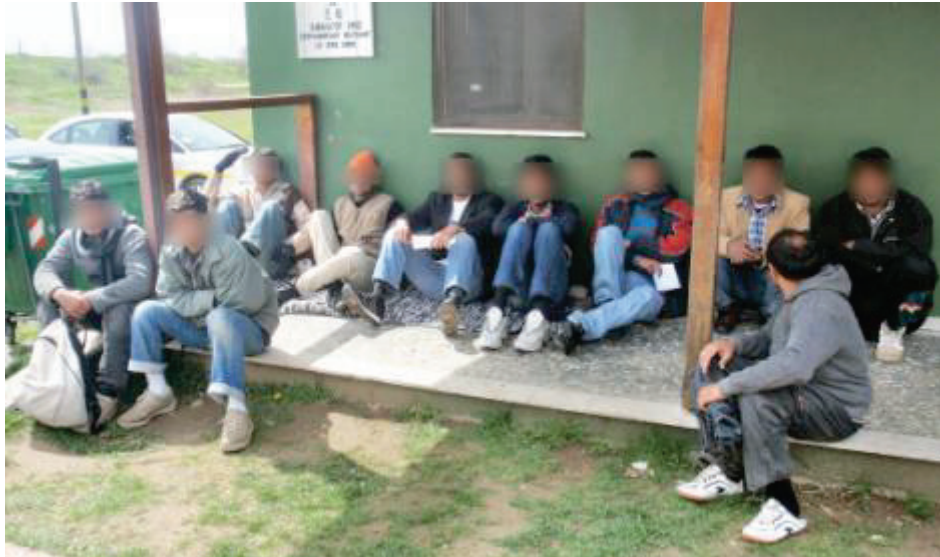
Figure 4: Released people at Poros screening centre, April 2011

The maximum period of detention of six months was reported to be under revision by the Greek authorities and shortening it to three months is being discussed. People from the Maghreb region might be considered to be released also after a shorter detention period.