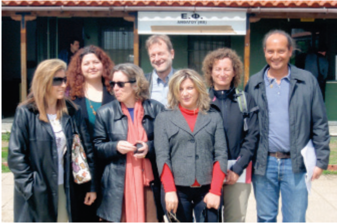
Figure 9: International team, April 2011