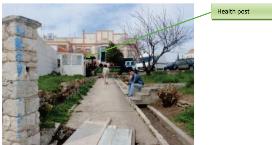
Figure 3: Detention centre in Soufli, April 2011

There are seven centres for migrants in the Thraki region, of which six are in the Evros prefecture. One is exclusively a screening centre for entry assessment (Poros Ferron) and one for imprisoned traffickers only; the latter was not visited. Closed detention centres are in Vena (Rodopi prefecture), Feres, Fylakio, Soufli and Tychero (Evros prefecture). The detention centre Fylakio Kyprinou is also used as entry screening centre. The police authorities are responsible for maintaining these centres, which are often located within the local police stations.