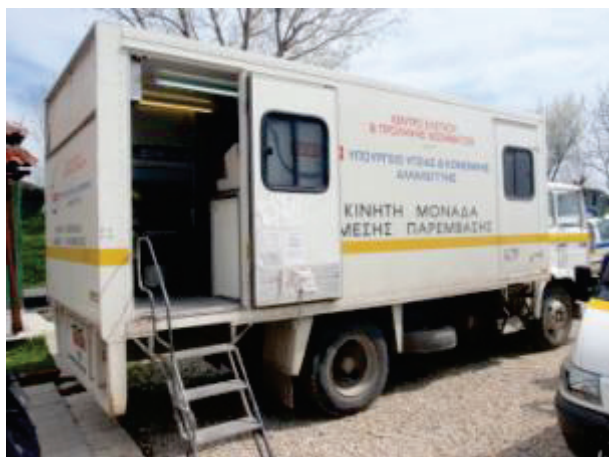
Figure 7: Screening health station, Poros, April 2011