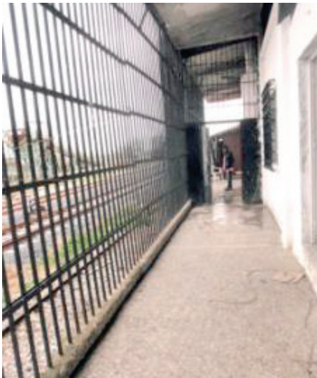
Figure 12: Detention centre at Tychero, April 2011