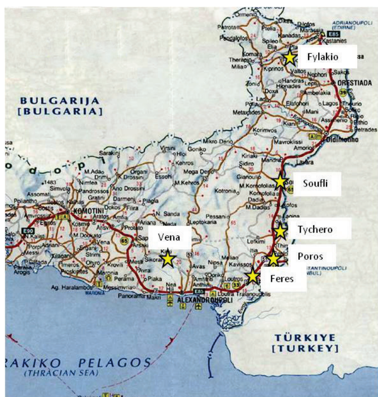
Figure 5: Distribution of detention and screening centres in Thraki region

The five detention centres in Vena, Feres, Fylakio, Soufli and Tycherio and the screening centre in Poros were visited (Figure 5). Information was obtained from representatives of different organisations, including the Hellenic Centre for Disease Prevention and Control (HCDCP), Ministry of Health and Social Solidarity, Public Health Laboratory in Alexandroupolis, University Hospital of Alexandroupolis, District Hospital of Didymoteicho, District Hospital of Komotini, as well as physicians, nurses, psychologists, social workers and police officers at the detention and screening centres. In addition, detained and released persons in all detention and screening centres were interviewed.