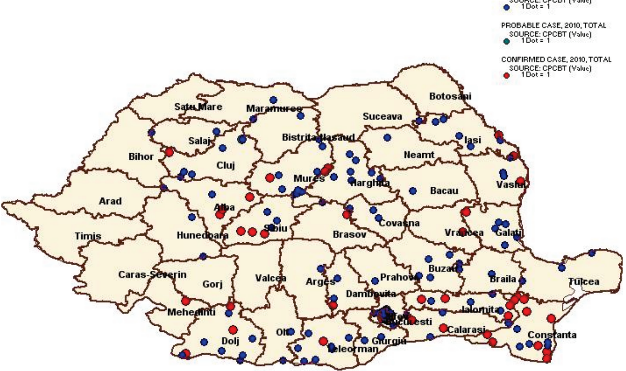
Figure 2: Map of suspected, probable and confirmed cases of WNV infection in Romania, July-September 2010 SUSPECTED CASE, 2010, TOTAL SOURCE: CPCBT (Value) 1 Dot = 1 PROBABLE CASE, 2010, TOTAL SOURCE: CPCBT (Value) 1 Dot = 1

Source: Map provided by the Romanian National Institute of Public Health.