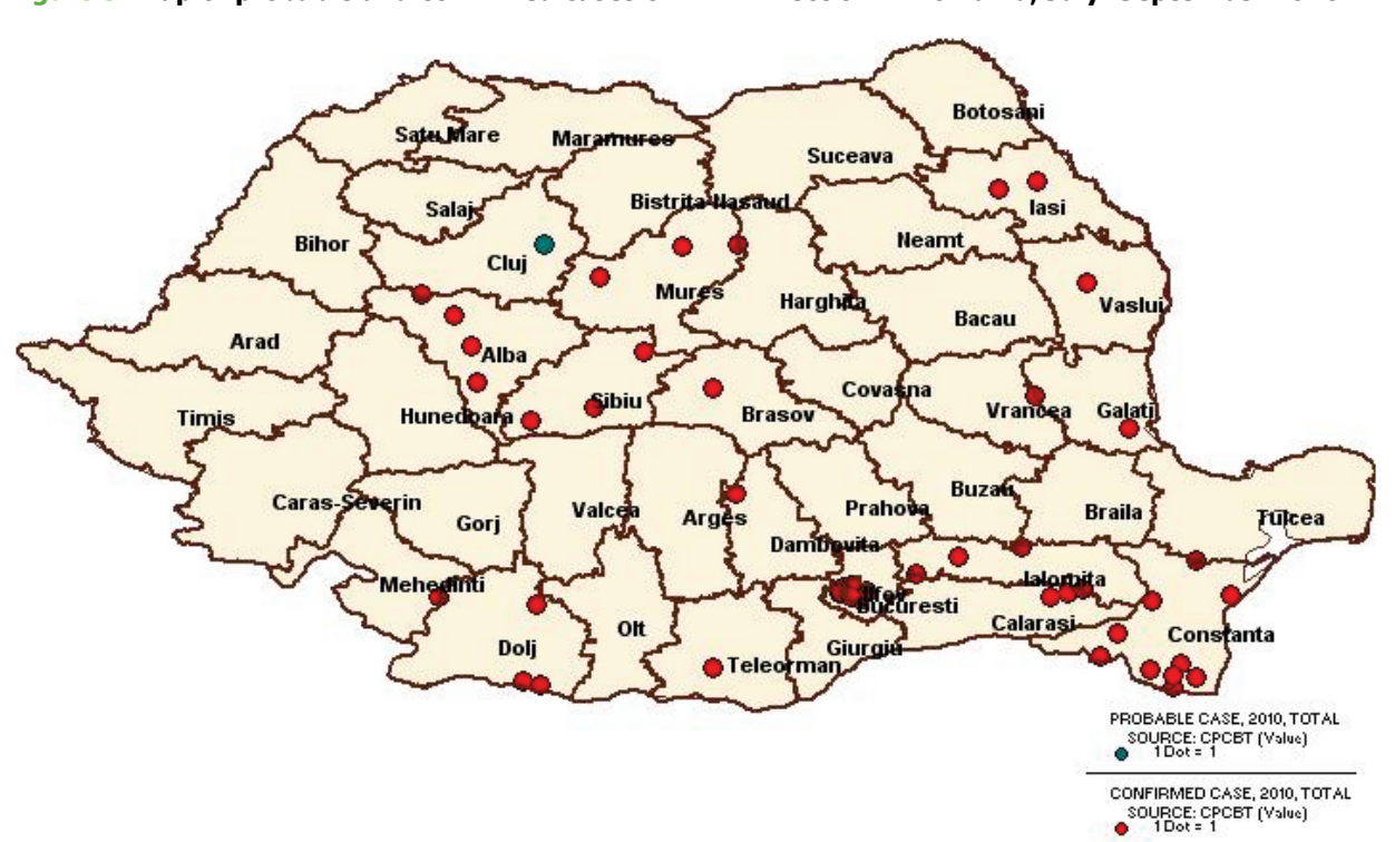
Figure 3: Map of probable and confirmed cases of WNV infection in Romania, July-September 2010

Dot distribution is arbitrary and does not represent the actual address of residence of confirmed, probable and suspected cases.