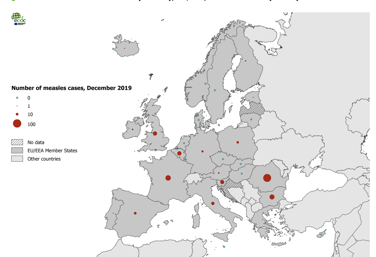
Figure 1. Number of measles cases by country, EU/EEA, December 2019 (n=286)

Where available, links to recent updates published by national public health authorities in the EU/EEA can be found in the CDTR.