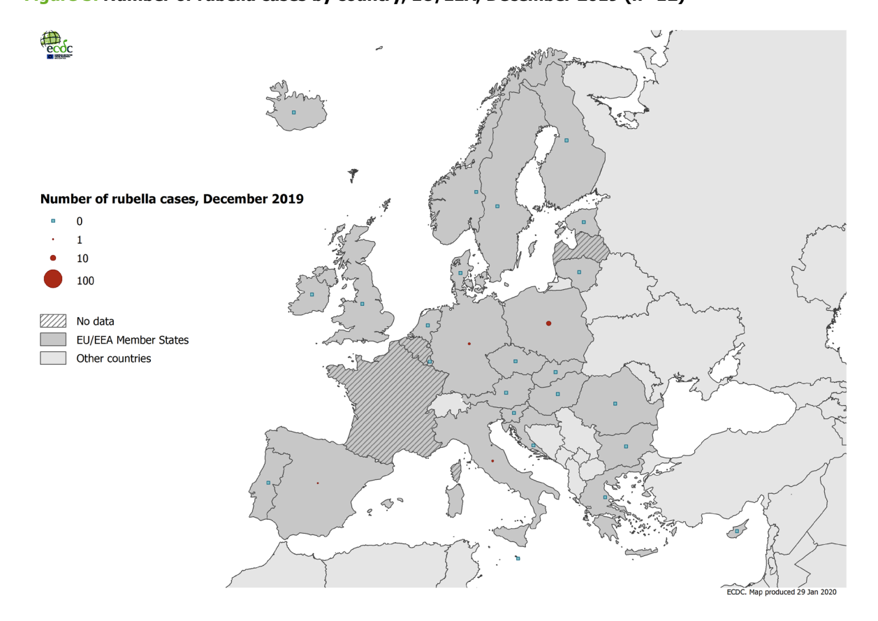
Figure 5. Number of rubella cases by country, EU/EEA, December 2019 (n=12)

Latvia did not report rubella data for December 2019 (see notes). Poland reported aggregate data, while all other countries reported case-based data. Cases classified as discarded (see notes) are not included in the figures presented in the report.