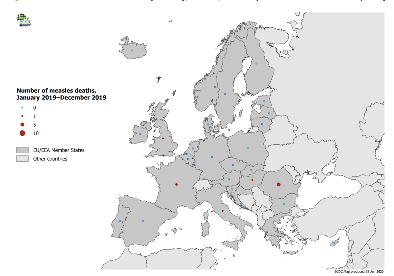
Figure 3. Number of measles deaths by country, EU/EEA, 1 January 2019–31 December 2019 (n=10)

Importation status of these cases was reported by 30 countries and was known for 9 836 cases (74%) - 759 (8%) of which were imported and 467 (5%) of which were import-related (see notes).