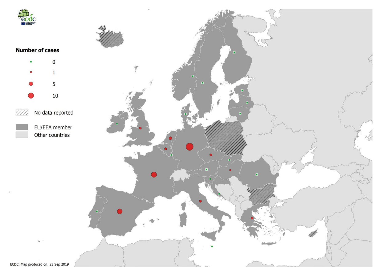
Figure 1. Distribution of Zika virus infection cases by country, EU/EEA, 2018

Among cases where gender was reported (n=50), the majority were female (n=30, 60%) with a male-to-female ratio of 0.7:1. Cases were most frequently reported among those aged 25–44 years (n=29, 58%) followed by 45–64-year-olds (n=11, 22%). The mean age was 37.3 years and the median age was 33 years for males and 32 years for females. There was a higher proportion of females than males in 5–14 year-olds and 25–44-year-olds (Figure 2).