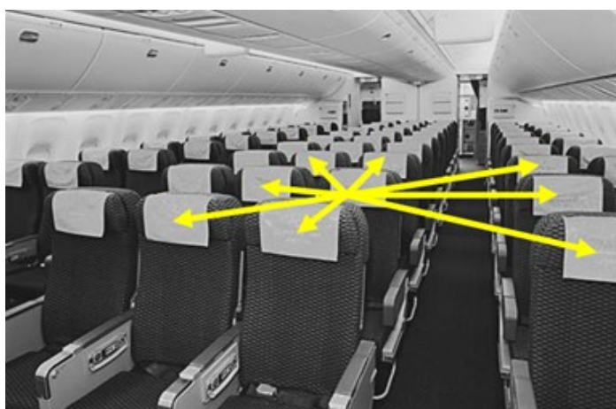
Figure 2. Seating area to be considered for contact tracing of Ebola disease cases on aircraft

Cleaning staff: The cleaning staff that cleaned the section and seat where the index case was seated should be traced back.