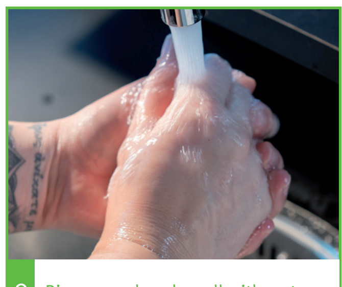
Rinse your hands well with water