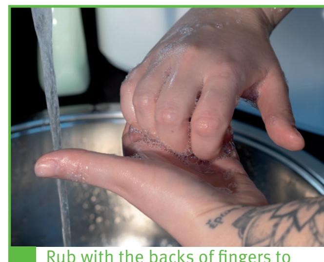
Rub with the backs of fingers to opposing palms, with fingers interlaced