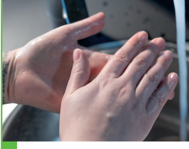
Rub your hands together, palm to palm