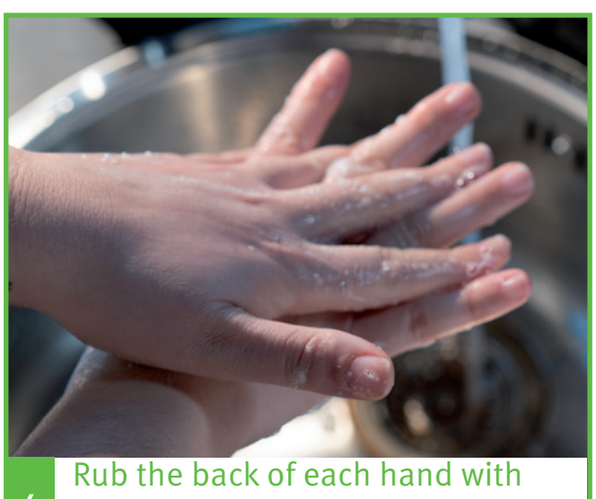
Rub the back of each hand with the palm of the other hand, with fingers interlaced