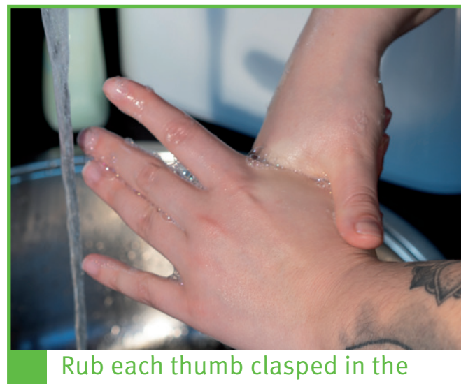
Rub each thumb clasped in the opposite hand using a rotational movement