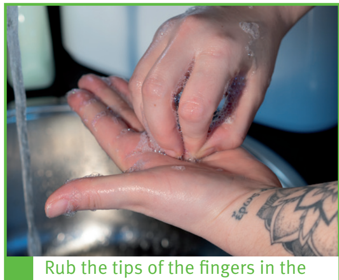
Rub the tips of the fingers in the opposite palm using a circular motion