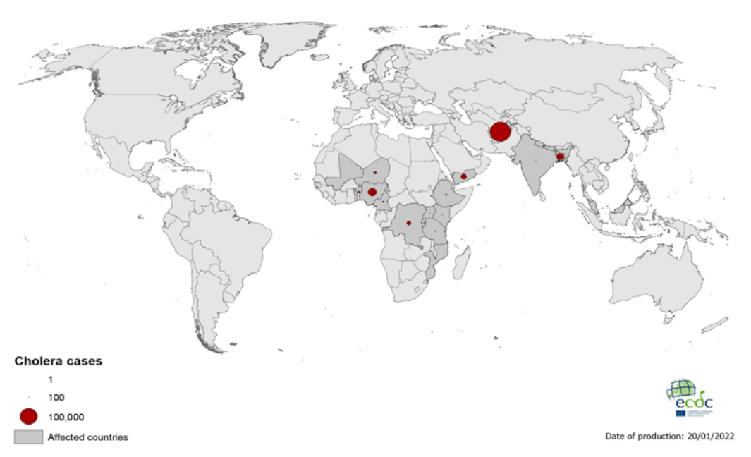
Geographical distribution of cholera cases reported worldwide as of December 2021