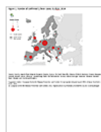
Figure 1. Reported confirmed cholera cases, EU/EEA, 2014