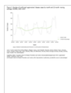
Figure 4. Reported confirmed cholera cases: trend and number, EU/EEA, 2010–2014