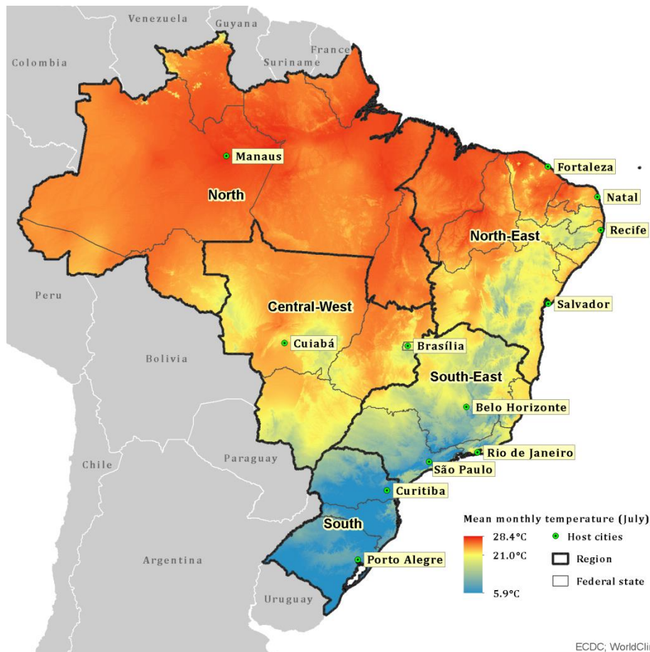
Figure 1. Cities hosting the Brazil 2014 FIFA World Cup and average monthly temperature in July

Brazil is expected to attract an estimated 600 000 international tourists and three million domestic travellers [8] during the football World Cup from 12 June to 13 July 2014. Most European travellers will reach Brazil using commercial airlines and will for the most part visit only the host venues for the football matches (12 host cities, see Figure 1), but may also visit other parts of Brazil. Domestic travel in Brazil will be mostly by commercial aircraft or by public/private ground transportation near the sport venues. The 2014 Brazil World Cup will take place during the austral winter, with tropical heat in the north and chilly temperature in the south of the country; some areas will be dry while it will be rainy season in others [9].