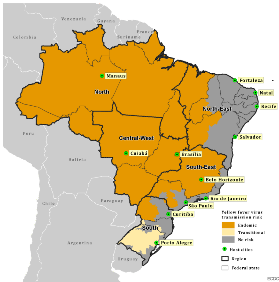
Figure 4. Cities hosting the 2014 FIFA World Cup and areas of yellow fever transmission in Brazil