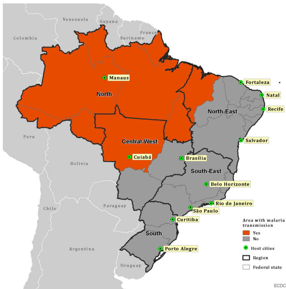
Figure 3. Cities hosting the 2014 FIFA World Cup and areas of malaria transmission in Brazil