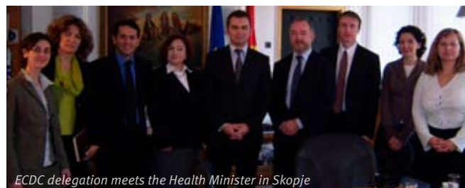
ECDC delegation meets the Health Minister in Skopje

On 27-28 October, an ECDC team paid a first ECDC country visit to Skopje. The purpose was to establish contacts with key stakeholders, to prioritise areas for future collaboration and to discuss technical day-to-day working relations. The Minister of Health kindly received the ECDC delegation. Other meetings were held with the Institute for Health Protection and the WHO Country Office. ECDC warmly thanks all participants on this country visit, a visit which proved very positive with open and constructive exchanges.