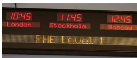
Decision to activate Public Health Event Level 1

This internal exercise simulated an outbreak of meningitis in Austria during the Euro 2008 Football Championship. It aimed to test ECDC's new Public Health Event Operation Plan (PHEOP) and the Standards Operating Procedures (SOP).