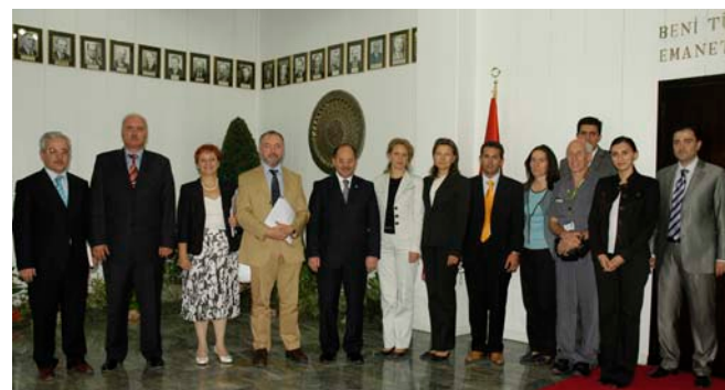
ECDC delegation with Recep Akdağ, Turkish Ministry for Health and his team.

On 8–9 July, an interdisciplinary team paid a first general ECDC country visit to Turkey. The main purpose was to establish contacts with key stakeholders, to prioritise areas for future collaboration and to discuss technical day-to-day working relations with experts. ECDC also intended to deepen its understanding of the epidemiological and public health situation in Turkey and identifying domains where ECDC could provide additional support. The Minister of Health kindly welcomed ECDC's experts and introduced his ministry, of which several directorates were presented. The team also visited the Refik Saydam National Hygiene Center. ECDC warmly thanks all participants in this country visit, a visit which proved very positive with open and constructive exchanges.