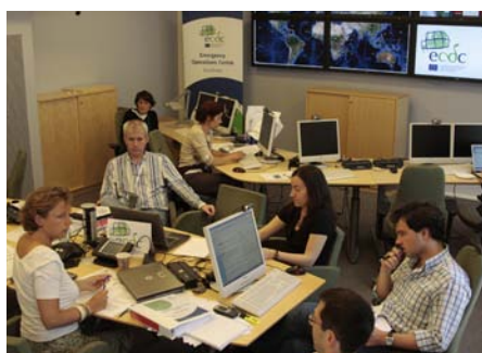
ECDC's staff working in the Emergency Operations Centre

Fast internal awareness, enhanced internal communication and dedicated logistic/helpdesk services are some of ECDC's new strengths. Activating an intranet and convening a staff meeting have been unanimously highlighted as key elements in ensuring staff are kept up-to-date.