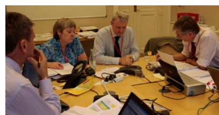
Evaluators and observers discussing ECDC's performance