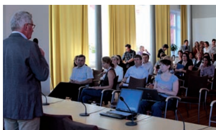
Johan Giesecke briefing ECDC's staff

Fast internal awareness, enhanced internal communication and dedicated logistic/helpdesk services are some of ECDC's new strengths. Activating an intranet and convening a staff meeting have been unanimously highlighted as key elements in ensuring staff are kept up-to-date.