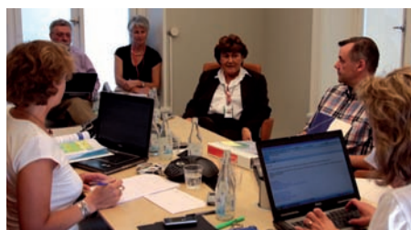
First meeting of the Strategic Public Health Event Group

ECDC's readiness in responding to public health events has significantly improved since last year's exercise. This was the main conclusion following Exercise Green Field, conducted on 3–4 June 2008.