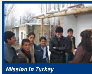
Mission in Turkey

Since ECDC's creation, its staff has been present in the field to address the potential threat posed by influenza. Field missions to assess the threat of Avian Influenza were undertaken in Iraq and Turkey. In October 2007 ECDC, in cooperation with the Commission and WHO/Europe, completed a series of country visits in all the 27 EU Member States and 3 EFTA/EEA countries to assess their preparedness against pandemic influenza. Similar missions were run in a few selected non-EU countries: Turkey, Ukraine and Kazakhstan. In 2008, particular focus will be put on Croatia, FYROM and Turkey. Since 2005, an assessment tool has been developed by ECDC in cooperation with its partners and has evolved since then.