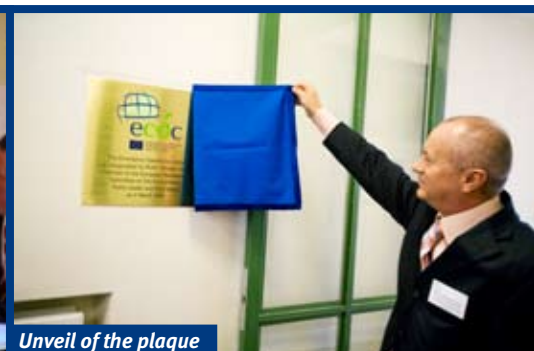
Unveil of the plaque