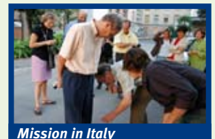
Mission in Italy

One and a half years later, the first outbreak of Chikungunya virus in Europe occurred in summer 2007 in the region of Emilia-Romagna in Italy. Considering the risk of spread due to the presence of the vector Aedes albopictus in other EU countries, the Italian health authorities agreed on a joint ECDC/WHO risk assessment visit conducted from 17 to 21 September, the results of which are published on ECDC's website. In follow-up, further preparedness activities have taken place, including risk mapping for vector establishment assessing the risk of virus introduction in the EU and the development of communication tool kits for the Member States' health authorities that include fact sheets and information for practitioners, general public and travelers to affected areas.