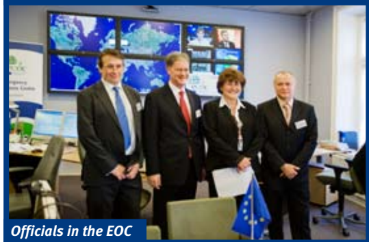
Officials in the EOC