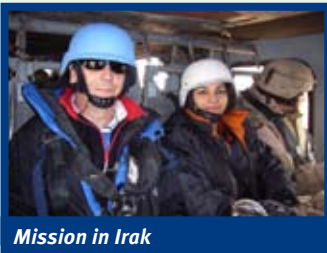
Mission in Irak