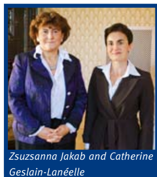
Zsuzsanna Jakab and Catherine Geslain-Lanéelle

was designated after Markos Kyprianou resigned from his functions on 29 February 2008. The Health Commissioner's portfolio covers three broad areas: public health, food safety and animal health. Taking over the implementation of the ambitious Health Strategy adopted in October 2007, the new Commissioner stressed, among others important challenges, the protection of the EU against global health threats such as a possible flu pandemic, the increase in new HIV/AIDS infections and the development of anti-microbial resistance.