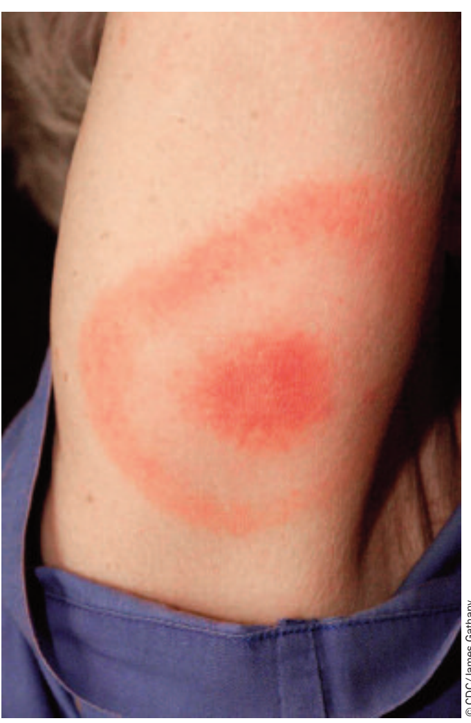
Fig. 2. An example of erythema migrans caused by LB infection.

No laboratory tests are required to diagnose erythema migrans (the rash characteristic of LB); a clinical evaluation and an assessment of the risk of tick exposure suffice. Laboratory tests are necessary to confirm a diagnosis of late-stage infection. B. burgdorferi antibodies are usually detectable within 4–8 weeks of infection: patients with late-stage infection usually test very strongly positive for these antibodies. However, the occurrence of false-positive tests in patients with other infections or conditions, such as autoimmune diseases, can lead to misdiagnosis and inappropriate treatment.