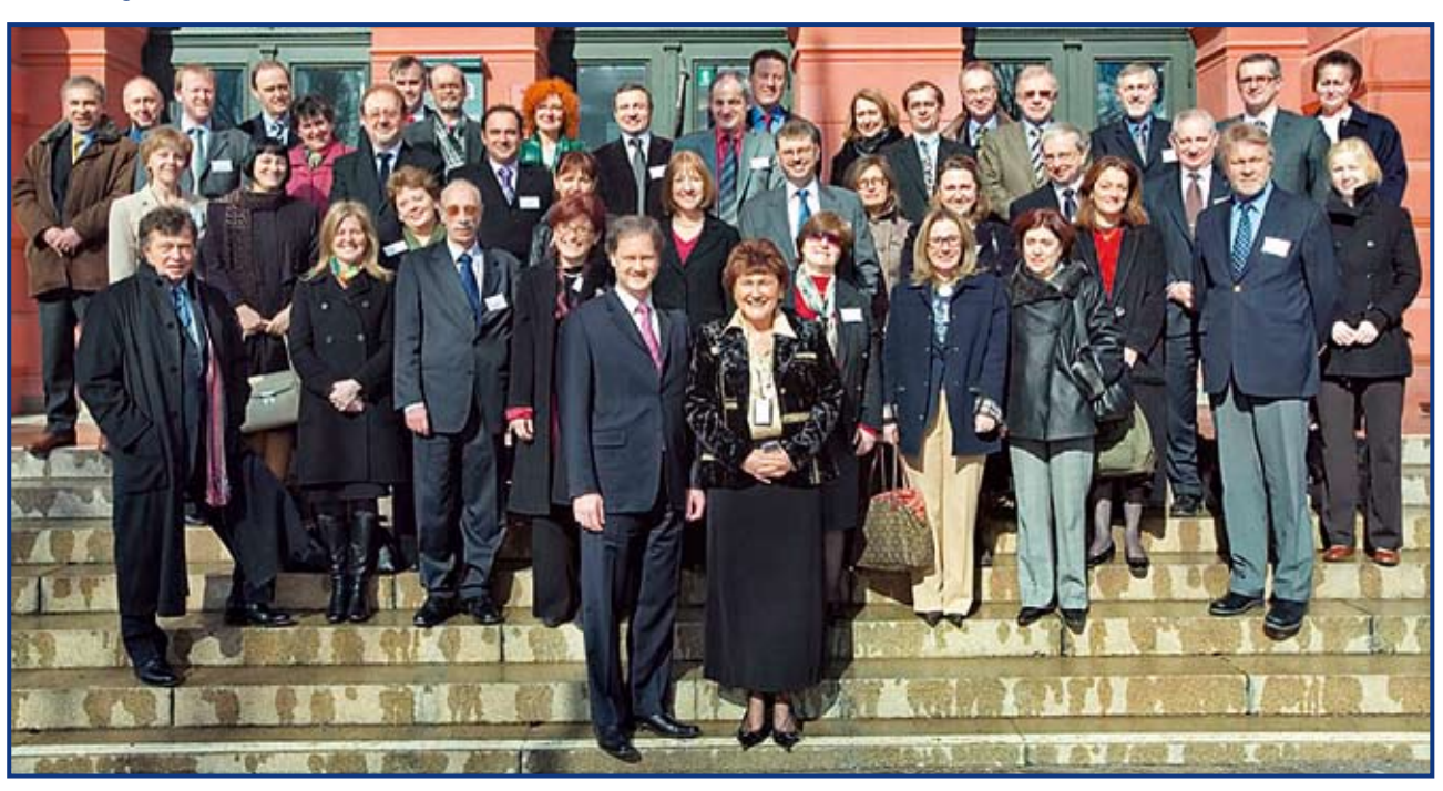
ECDC Management Board

MB9 gave a positive overall assessment of the document, finding it comprehensive, clear and well-structured. A number of suggestions for further refinement of the document were made: more specificity regarding outcomes, more emphasis on evaluation;