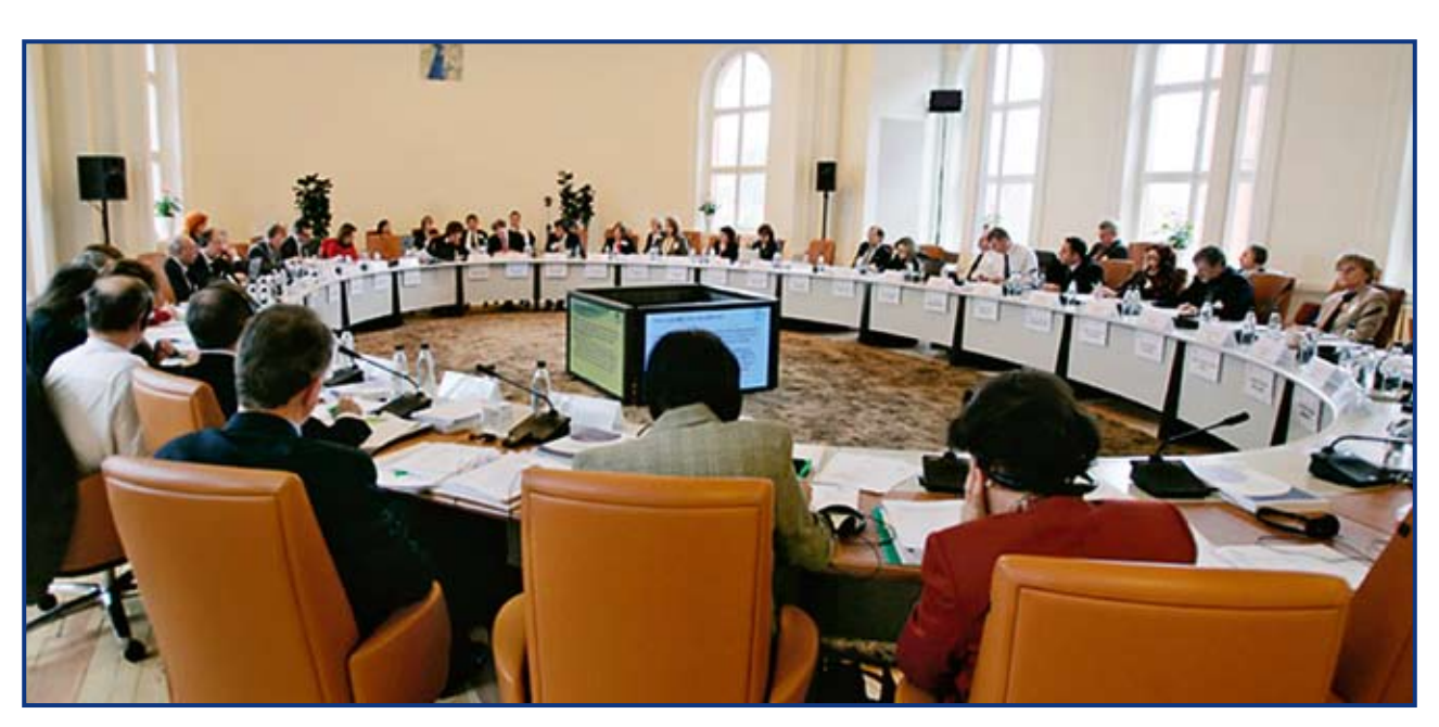
ECDC Advisory Forum meeting

Once the MS designate the Competent Bodies in the MS and the MB has compiled the list, ECDC will start to develop an effective collaboration with these national collaborating institutions. This will be the challenge for 2007–2009.