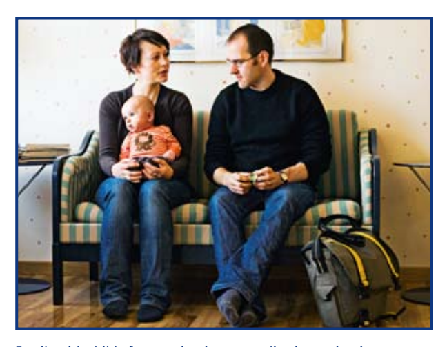
Family with child after vaccination at paediatric vaccination centre, Stockholm, Sweden 2008

Furthermore, since ECDC does not have any laboratories of its own, it needs to build a close collaboration with microbiological laboratories across the EU to be able to perform its functions in surveillance, preparedness and response and scientific advice. This task includes not only linking to already existing centres of excellence, but also strengthening other microbiological laboratories in Europe, both for research and operational purposes.