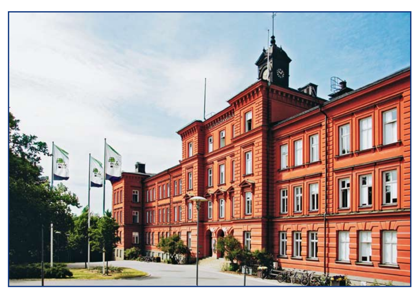
The Tomteboda – ECDC headquarters