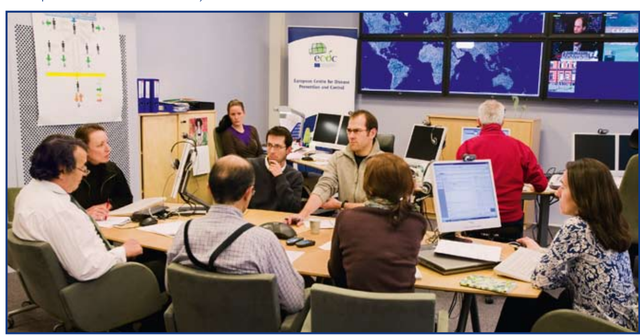
ECDC experts assess information received by the EOC

Investigating and controlling outbreaks requires a coordinated approach in the EU, given the mobility