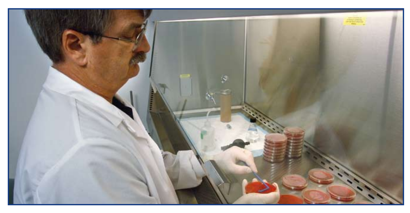
DNA hybridization analysis in laboratory