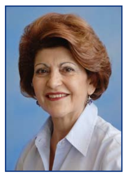
Androulla Vassiliou, European Commissioner for Health

ECDC is a strong aid for the Commission in the battle against infectious diseases and I believe that by working together in the direction laid out in this programme we can truly make a difference to the health of European citizens. We look forward to the continuation of our common efforts.