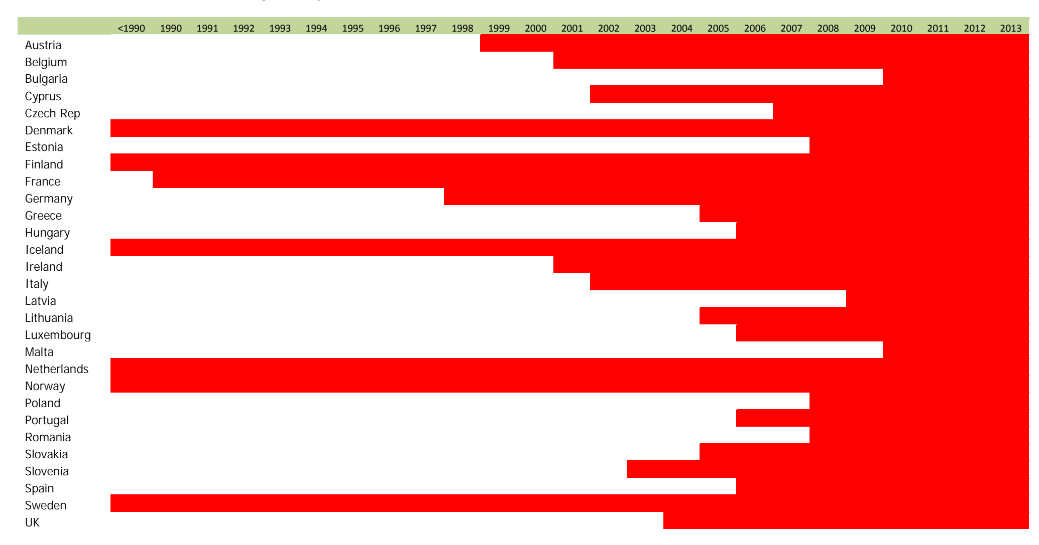
Table 14. Birth cohorts vaccinated using IPV-only schedule (indicated in red)